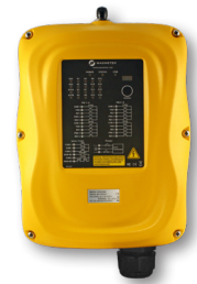
Flex EX 8/12 Receiver

For more information, contact your local Magnetek Sales Representative, radio.sales@magnetek.com , or the Magnetek location nearest you.