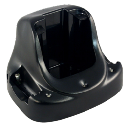
Charging Cradle Available for Easy Recharge