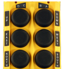
Labels Located Next To Buttons for Easy Visibility and Durability