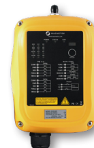
Flex EX 4/6 Receiver

Flex EX2 receivers were designed with field installation and serviceability in mind. Receivers come prewired with 6' of cable and mounting hardware allowing fast installation. Onboard diagnostic and output LEDs provide useful system status information when installing and troubleshooting. All components are easily accessible and field replaceable.